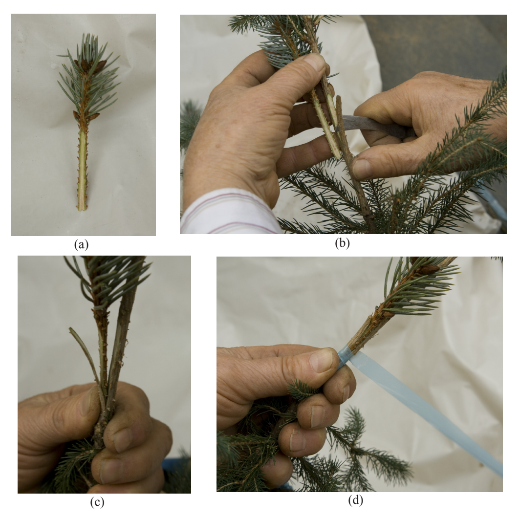
Figure 3 Illustration of the double-side-veneer grafting: (a) the scion was prepared with 4-5 cm long cut on both sides; (b) the rootstock cut preparation; (c) the scion was inserted into the rootstock cut; (d) the graft ing partners are tightly tying with plastic tape then the Ceraltin<sup>®</sup> wax will be applied (original photo I. Blada).

exceeded the above mentioned values; consequently, some losses in grafted plants have occurred. In such days, artificial misting was done inside the greenhouse.