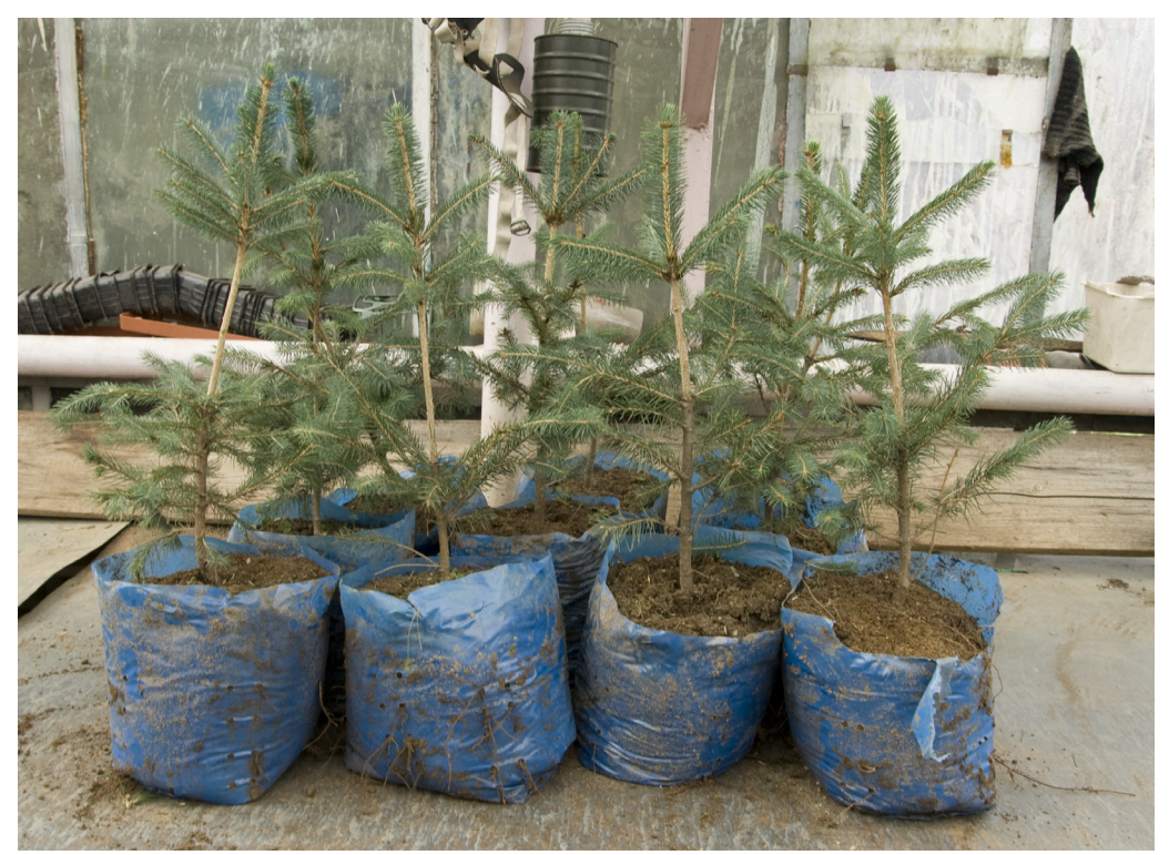
Figure 1 Sample of silver spruce rootstocks prepared for grafting

The grafting materials tested by this experiment were the plastic tape and the ecological Ceraltin<sup>®</sup> wax. The following grafting tapes were applied on the joined rootstock - scion: